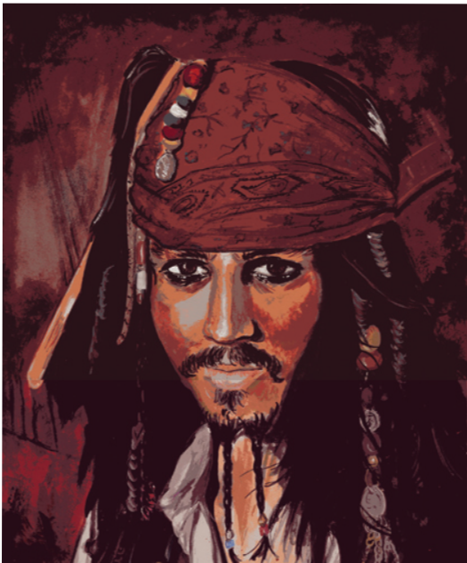
Photo Realistic Painting