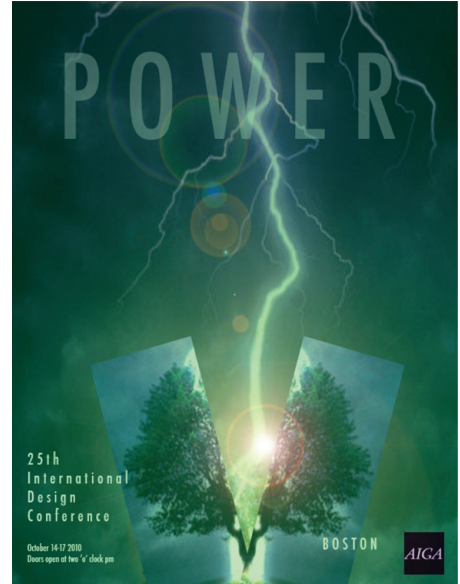
AIGA Poster Design