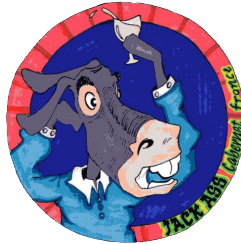
Wine Label Illustrations